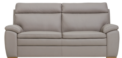
3 SEAT DUO HB