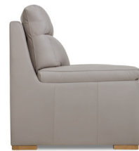
SIDE VIEW - HB