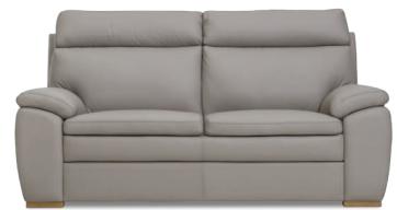
2.5 SEAT HB