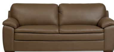
3 SEAT DUO