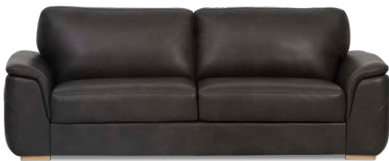
3 SEAT DUO